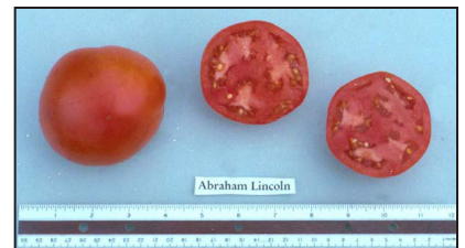
Abraham Lincoln tomato

to tolerate shipping and handling abuse, or that will grow in any part of the country. With hybrids, both parents are known and plants bred for specific characteristics.