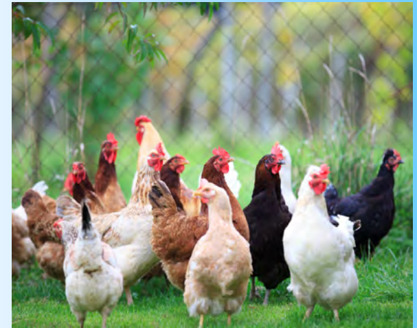
Small Flock Poultry